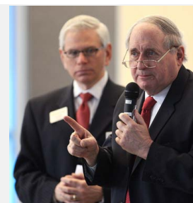
Senator Carl Levin in Kalamazoo